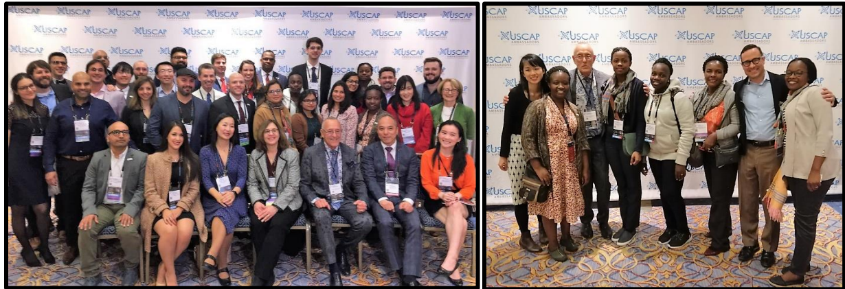
USCAP ambassadors' reception