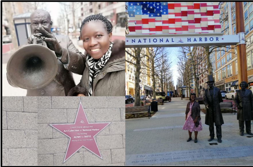
Exploring the art collection at National Harbor